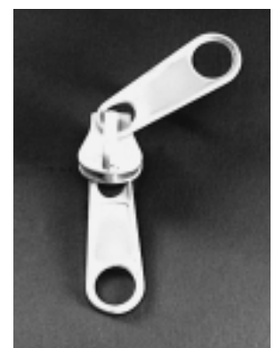
Double Pull Nonlock