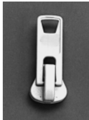
Single Pull Autolock