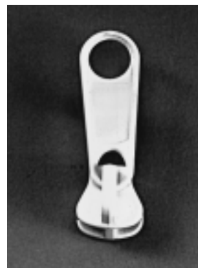
Single Pull Nonlock