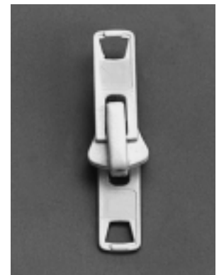
Double Pull Autolock